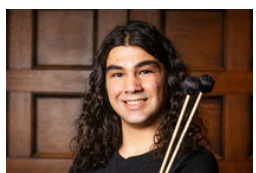
Jacob Nellis Percussion Ensemble